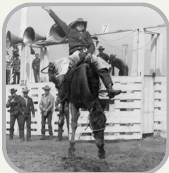
CROOKED RIVER ROUNDUP