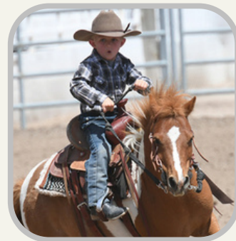
CENTRAL OREGON PEE WEE RODEO