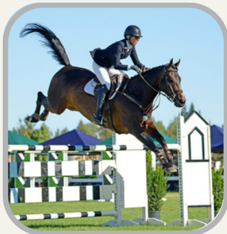
OREGON HIGH DESERT CLASSICS

CENTRAL OREGON PEE WEE RODEO: Oregon's largest and longest-running youth rodeo association. For more information, visit copwra.org